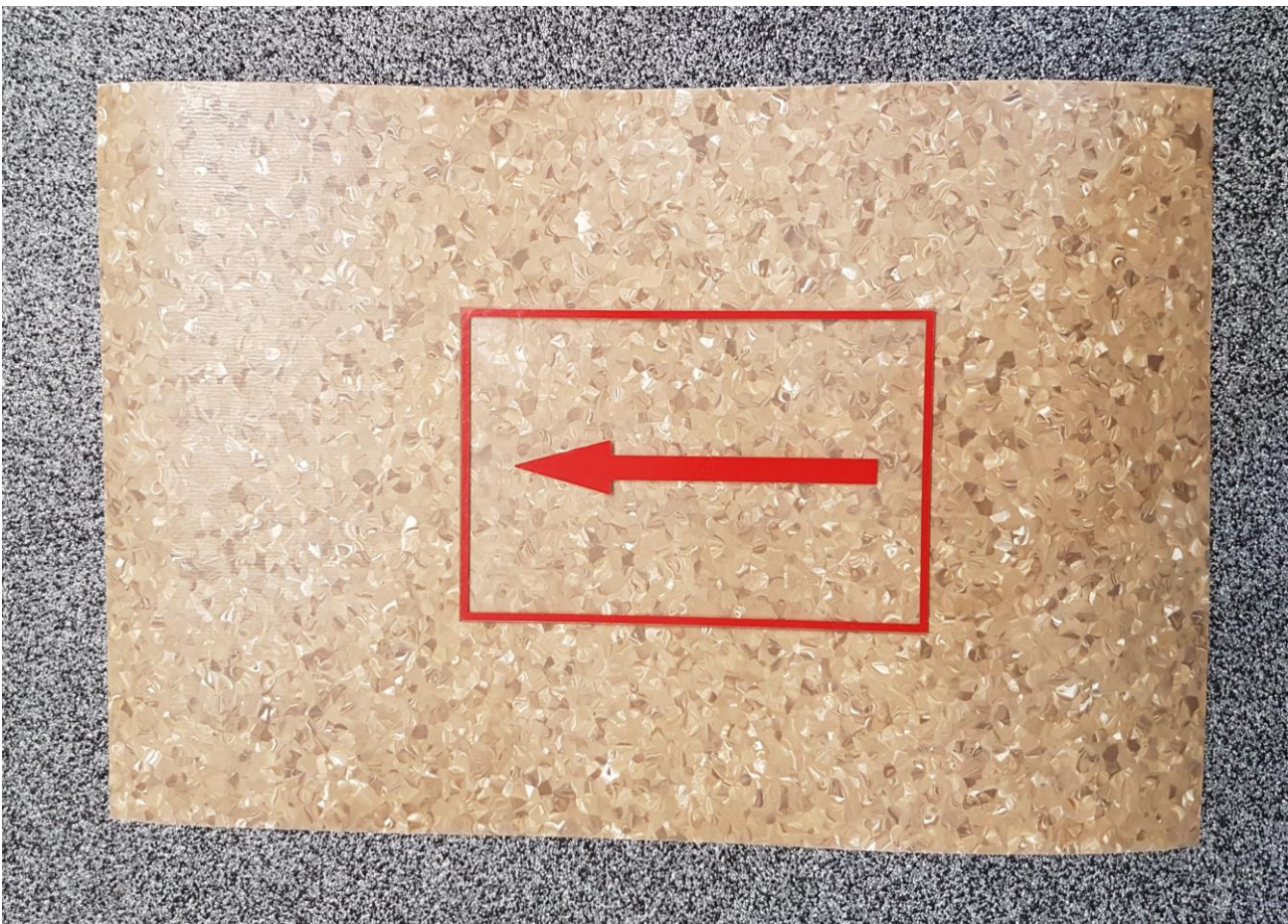
Figure 1: iQ One sheet vinyl.