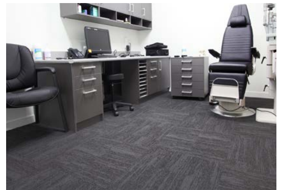
Health | Rotorua Eye Clinic

For more installed images, view the projects on our website: www.jacobsens.co.nz