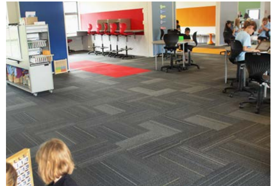
Education | Hingaia Peninsula School