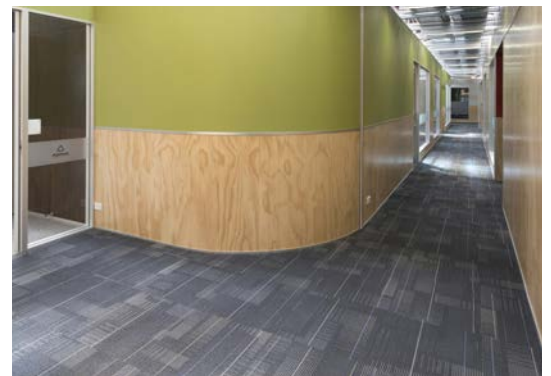
Education | NZMA