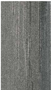
More colours available on order with a 4 week lead time. Concrete 50481