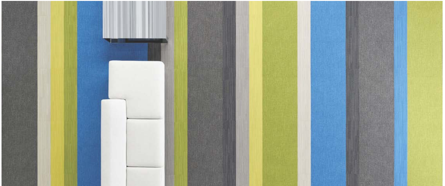
Planks Linear Installation