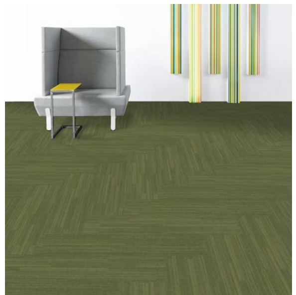
Color Form Enchanted