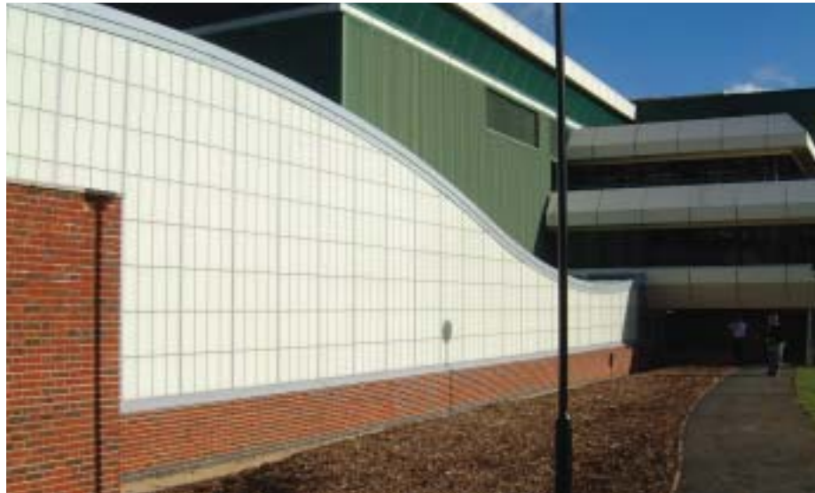
White Sands Missile Range, White Sands, NM

Kalwall Corporation's translucent systems protect occupants from line-of-sight outside the building, while filling the interior space with balanced daylight.