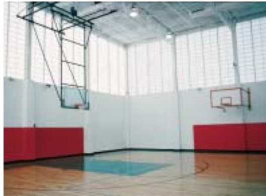
United States Navy Base