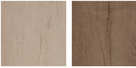
Balance 77755 LRV 30.7 V2 - Slight Variation Golden 77756 LRV 15.2 V3 - Moderate Variation